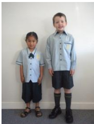
New Summer Uniform