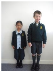
New Winter Uniform

School uniforms and school cardigans are available from Elizabeth Michael's in Term 2, 2012: Elizabeth Michael's Corporate Wear 357 New North Road, Kingsland, Auckland